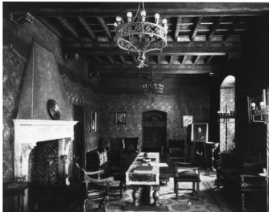
The conference room as it looked in 1926, and just about how it looks today.